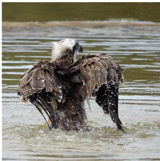
Osprey and Moor Hen