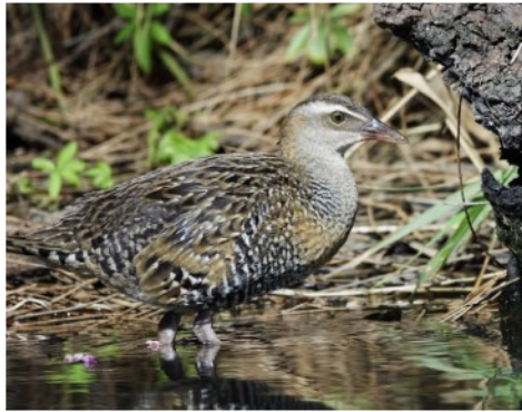
Buff Banded Rail - Russell Beardmore